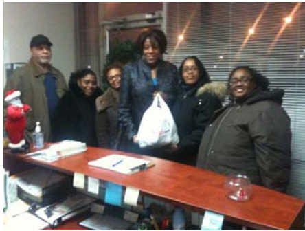
Residents who came into the ward office to receive a holiday food basket