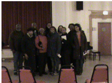
A few of the winners who attended the meeting