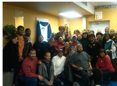
The wonderful volunteers at Greater Harvest