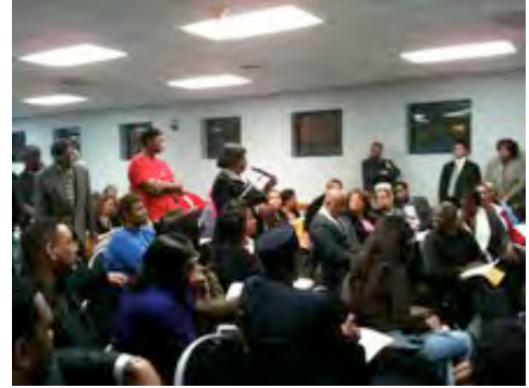
(Right) Attendees line up to ask questions and raise concerns.