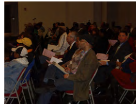
We had a great turn out!