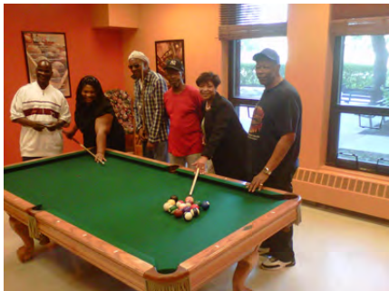
Rack em' up!