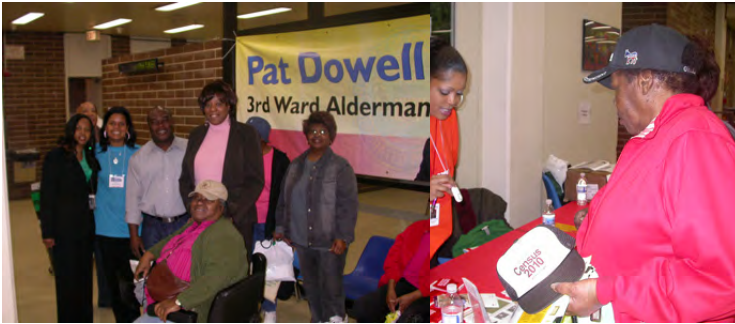
Third Ward Residents and The Census Bureau and Red Cross were on hand to assist Staff residents