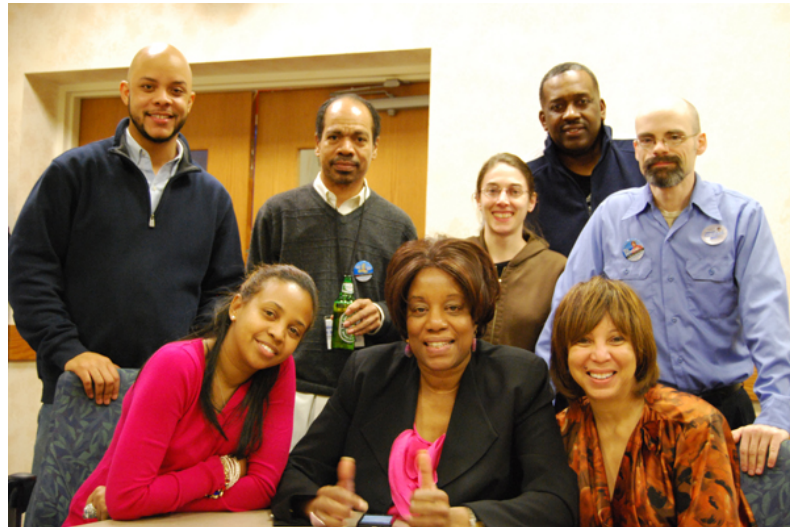
Staff and Volunteers